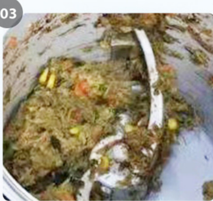
High efficiency dehydration