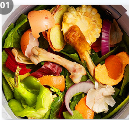
Crush the hard bones