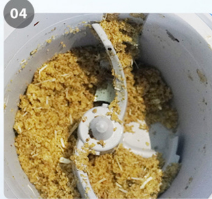
Drying and deodorizing