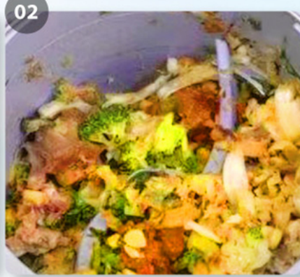
Smash to pieces